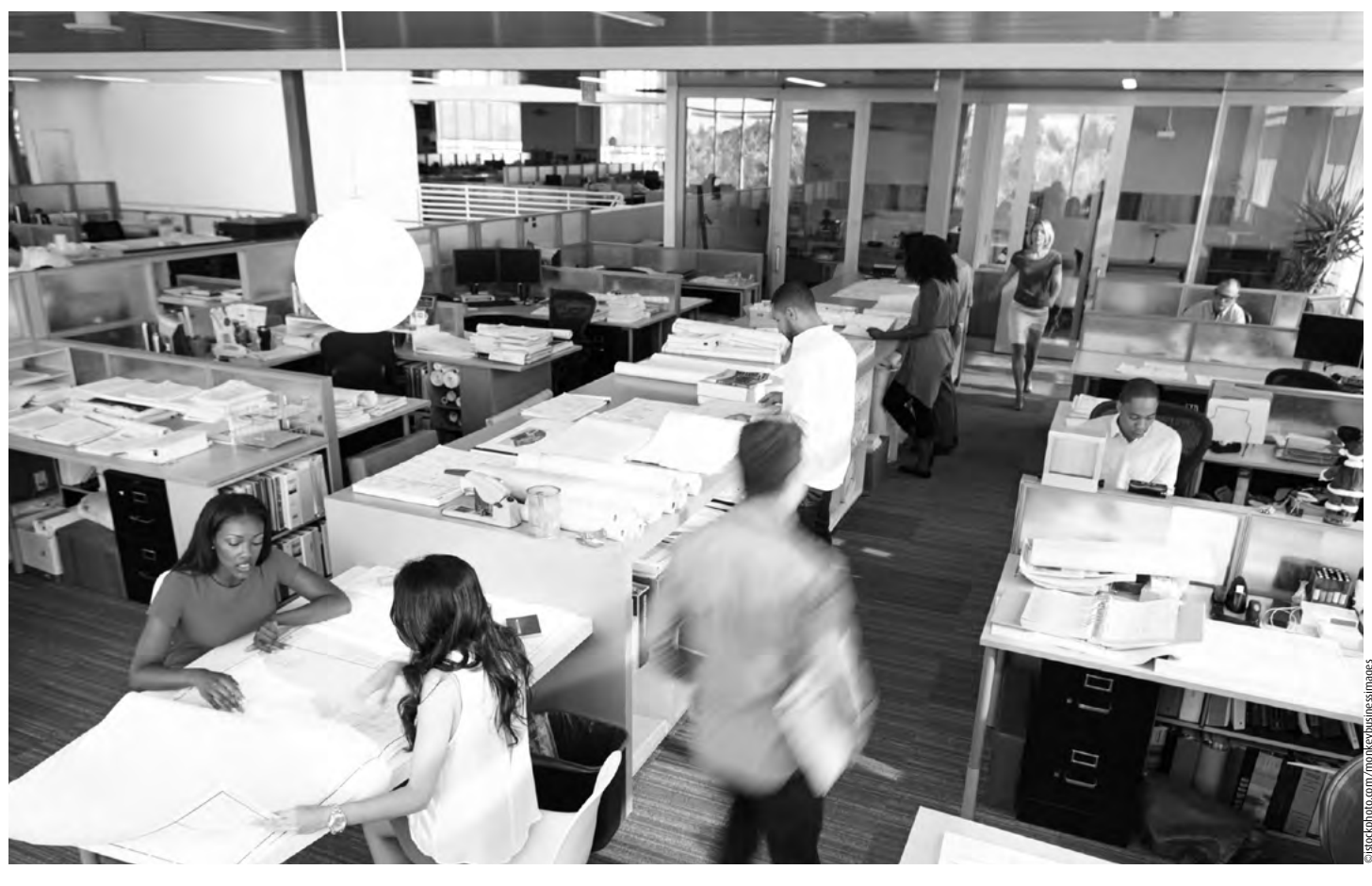
80/20 thinking turns office carpet industry on its head