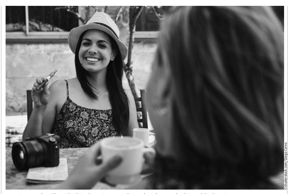
Vaping and coffee, habit-forming products hook into habitual behaviours

You'll find more on these four triggers and the five sources of habit triggers in the online tools and resources – click the button on the page opposite.