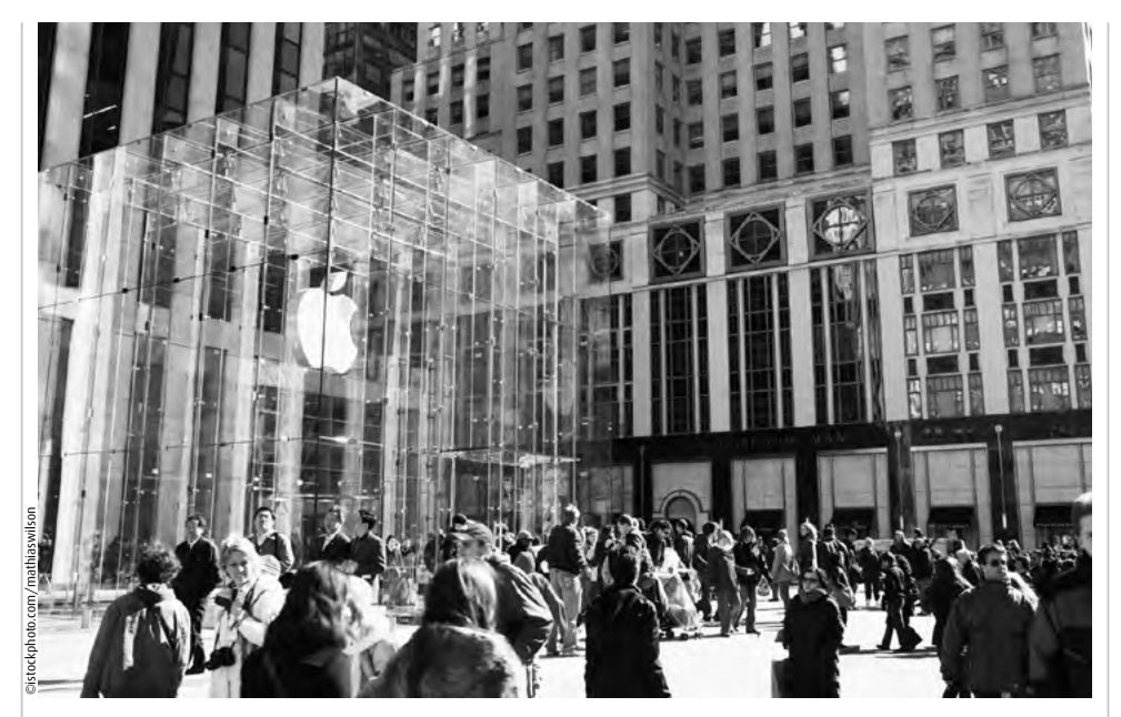
Apple, Lego and Virgin Media all use Net Promoter Score