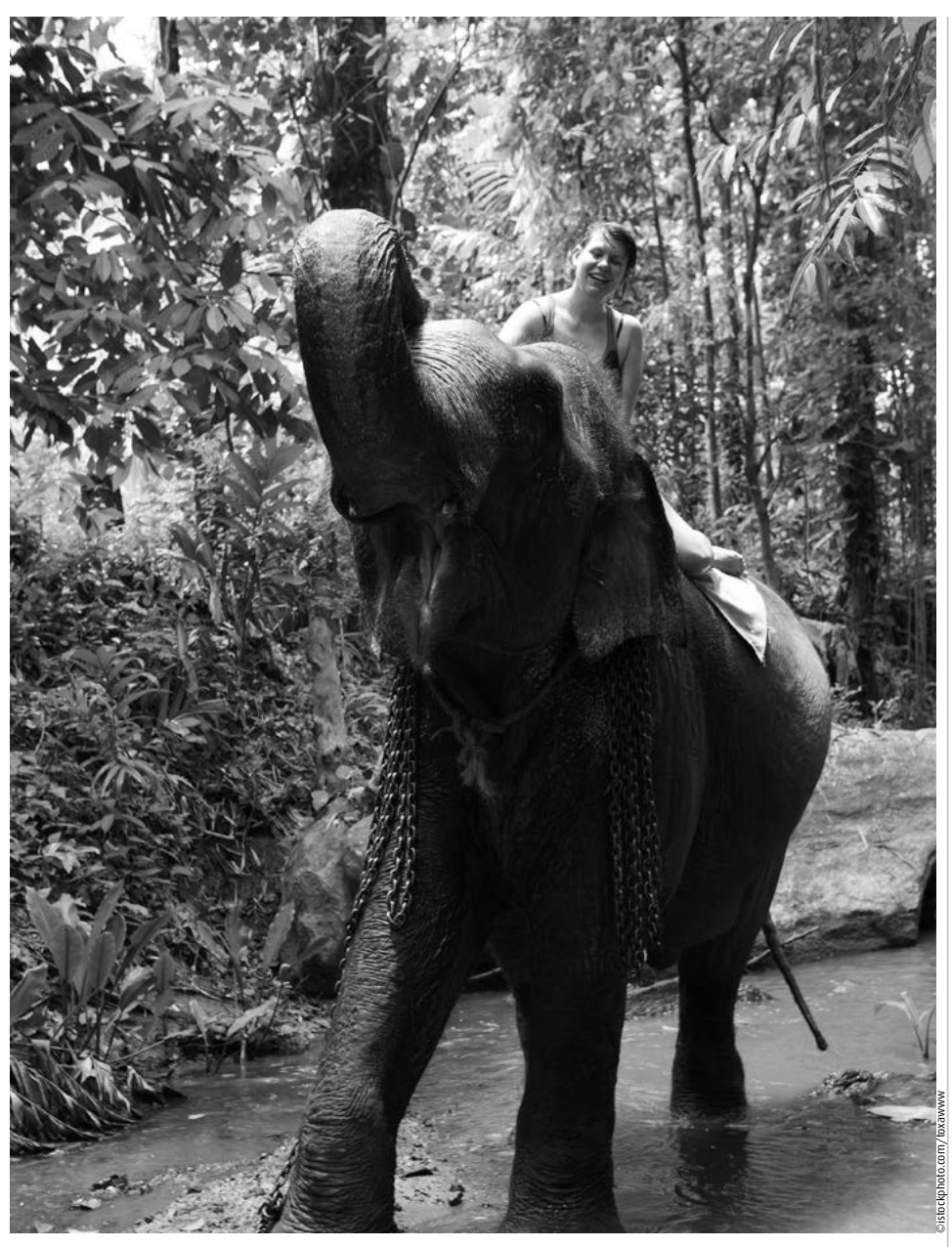
Change works when you...direct the rider, motivate the elephant and shape the path.

For insightful stories on each of these elements, check out the downloadable tools and resources for this edition of Business Bitesize.